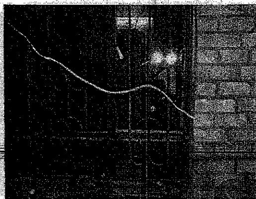
Exterior pic of shots through window.2

ALL ITEMS ARE REDACTED UNDER 5 USC 552(B)(6) UNLESS OTHERWISE NOTED