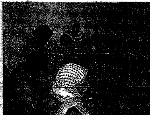
[REDACTED] meeting with family.