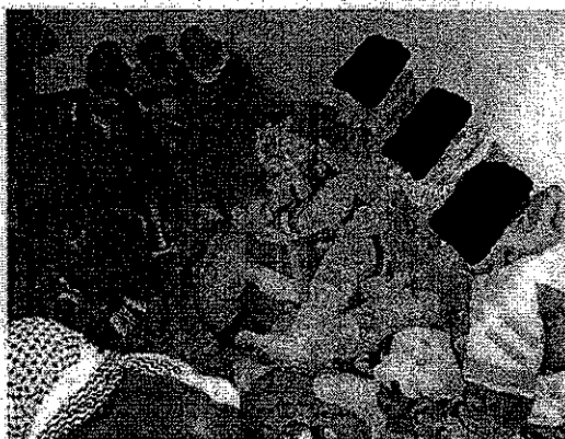
Voodoo talking with Sajaad Yaseen.