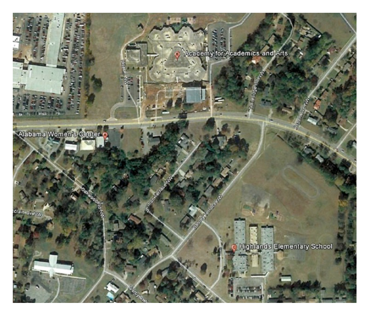
The Huntsville clinic (A) and the two schools, the Academy for Academics and Arts (B) and Highlands Elementary School (C). Pl. Ex. 31 (excerpt).

The Academy for Academics and Arts sits diagonally across a five-lane street from, and to the east of, the Huntsville clinic. Published newspaper articles report that some parents have complained about the presence of