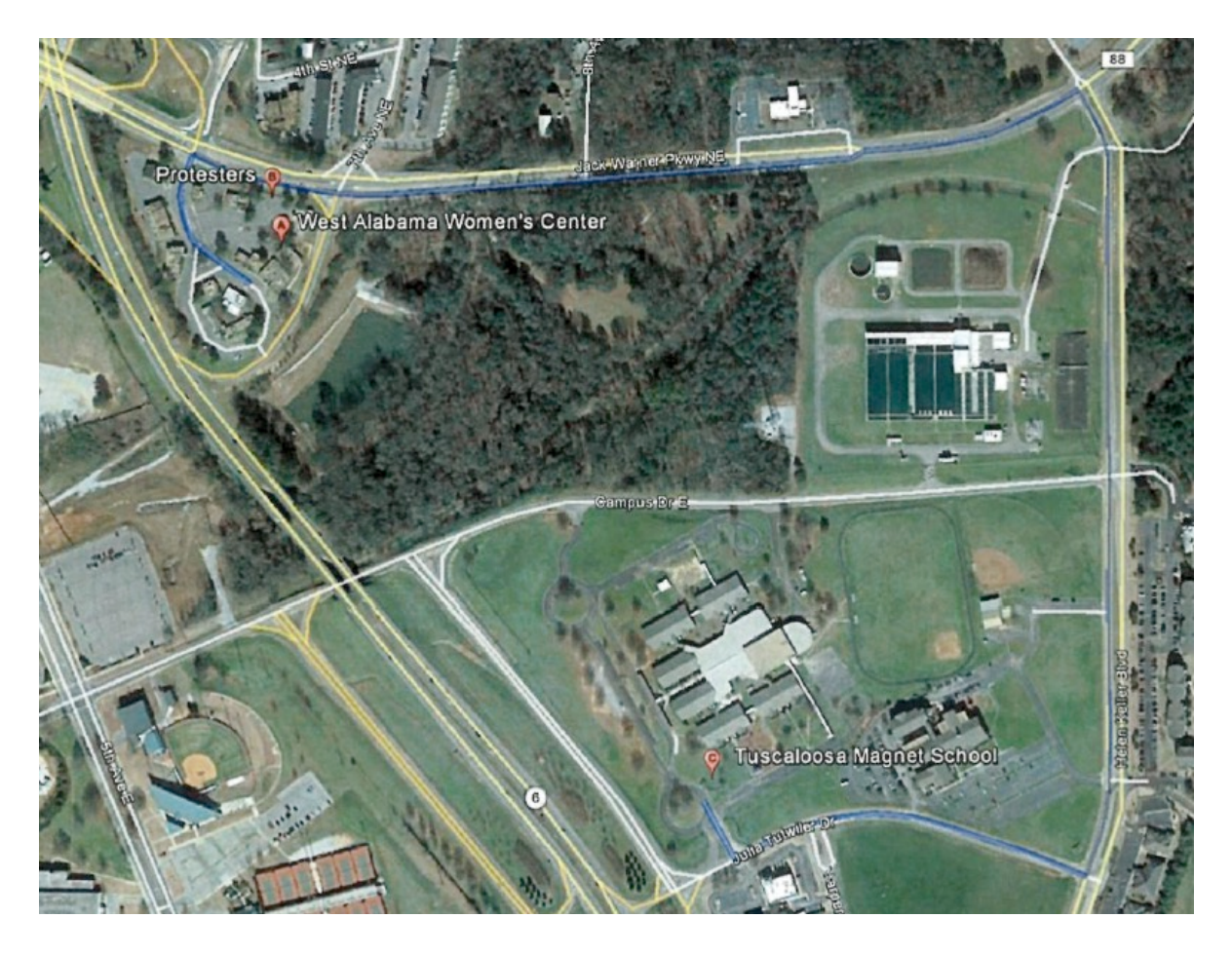
The Tuscaloosa clinic (A) and its protestors (B) are separated from the nearest school (C) by a large wooded area. Pl. Ex. 27 (excerpt).

to control their children's exposure to the subject of abortion.