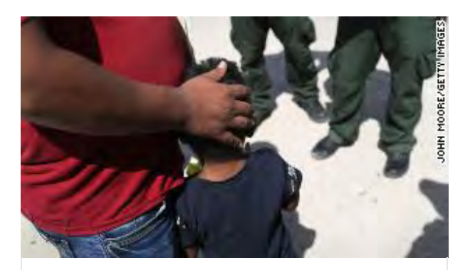
Related Article: Trump again falsely blames the Democrats for his administration's family separations

On the call, Department of Homeland Security also said that prosecutions have more than doubled, but acknowledges they are not currently at 100%. Asked why they are prioritizing families in this effort as opposed to single adults, as they get closer to 100%, officials declined to explain how they choose whom to refer.