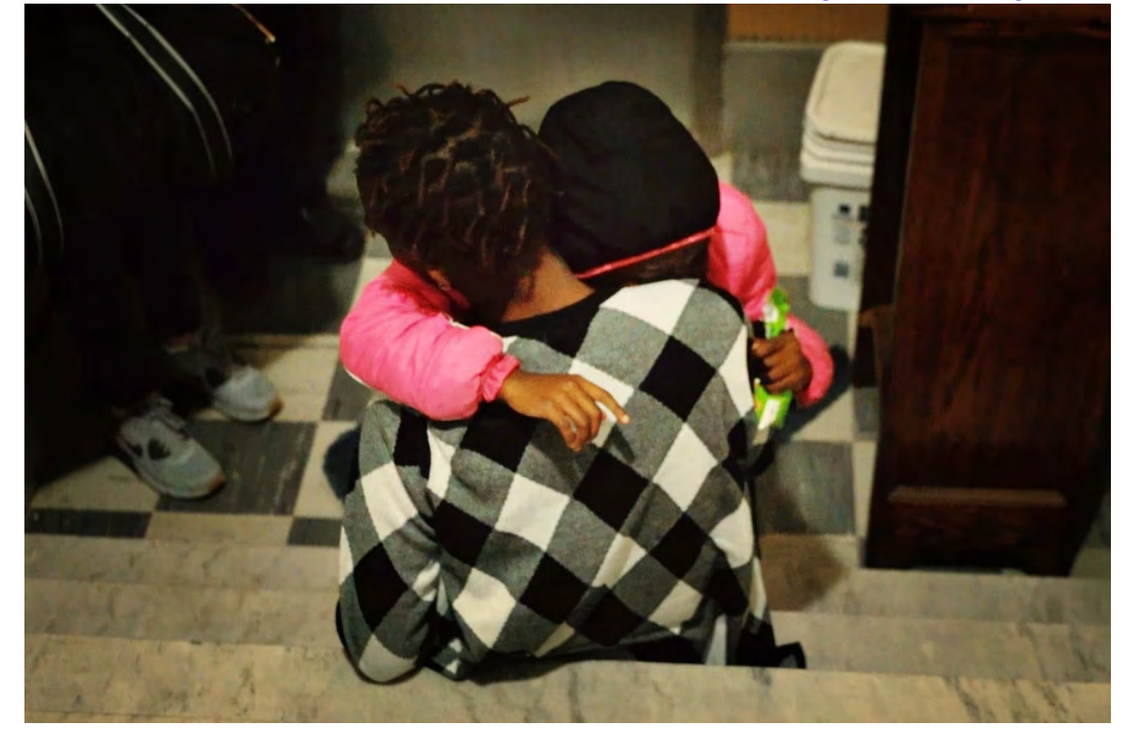
A woman was reunited with her 7-year-old daughter in Chicago in March after they had been separated for four months in immigration detention.