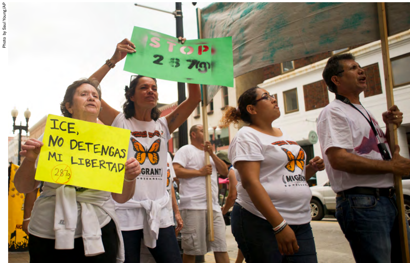
Community members express their opposition to the harmful effects of 287(g).

Problems with the 287(g) program predate Biden's presidency and even the Trump era, but there is now a vital opportunity to make meaningful change. The choice is clear: Continue to partner with officials who try to instill fear, engage in racial profiling, and violate civil rights, or work toward a vision focused on justice, safety, and equality under the law. It should be an easy one.