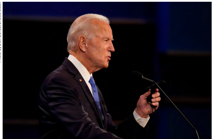
President Biden previously pledged to "end the Trump administration's historic use of 287(g) agreements."