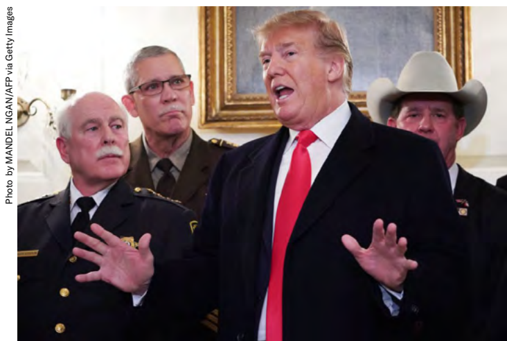
President Trump speaks at the White House.