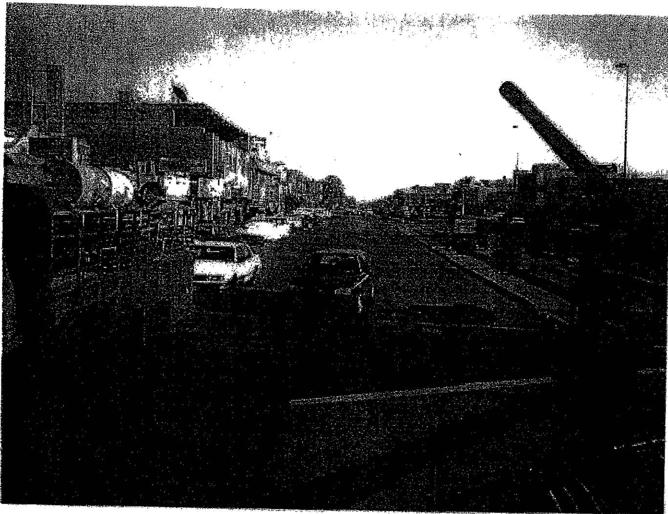
Exhibit F 256 BCT No. 05-179