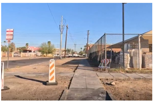
Madison Street and 13th Avenue, January 2023, November 2023.