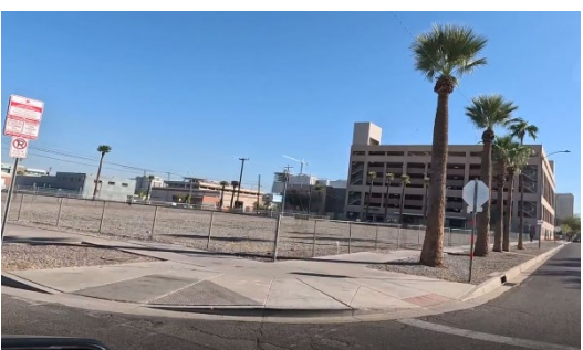
Madison Street and 9th Avenue, January 2023, November 2023.