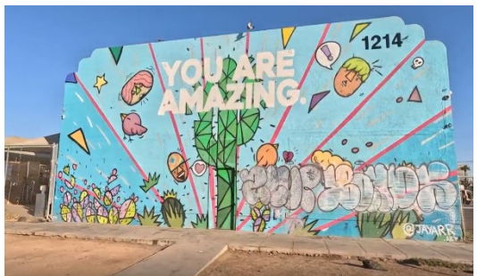
Mural on Madison Street, January 2023, November 2023.