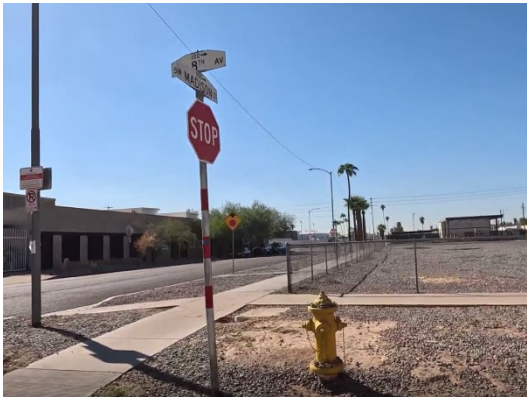
Madison Street and 8th Avenue, January 2023, November 2023.