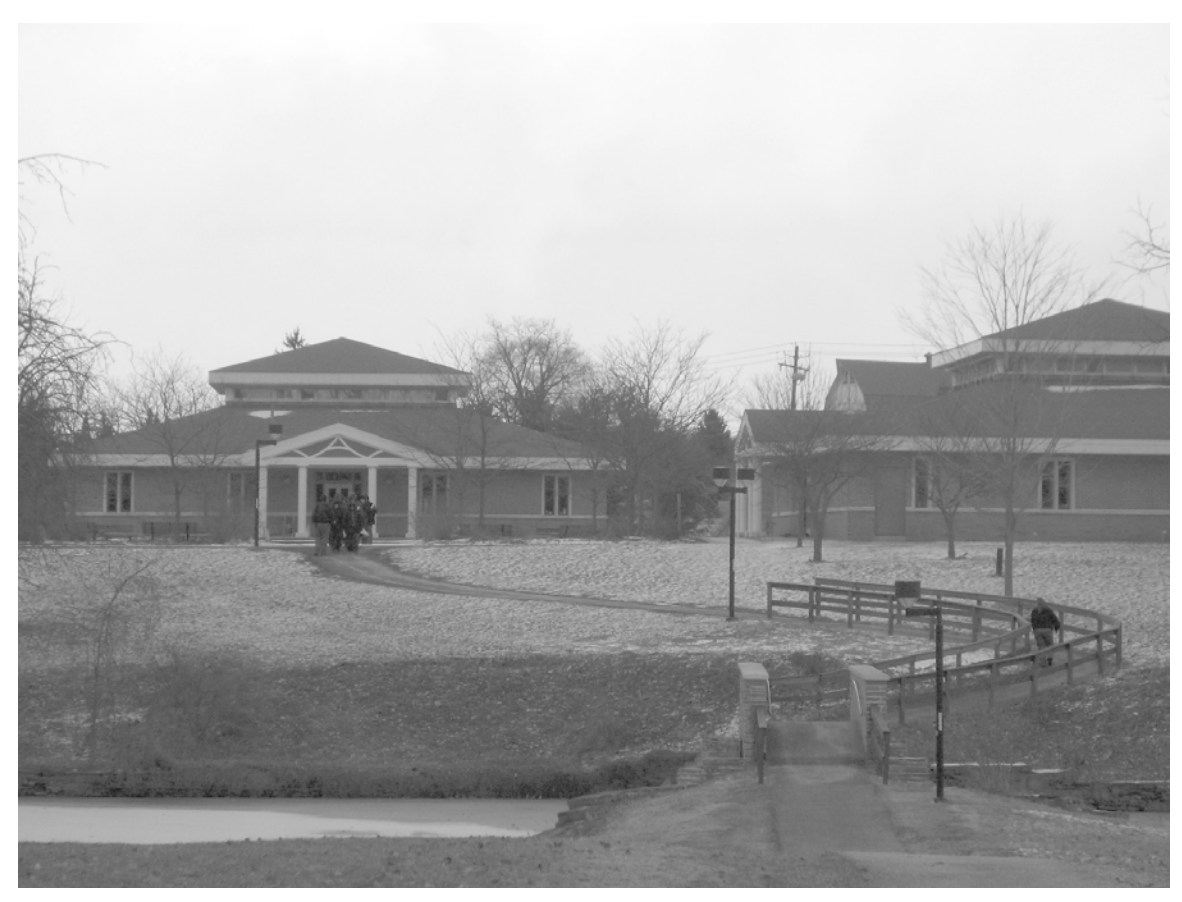
Girls prepare to move from one area of the Lansing facility to another.